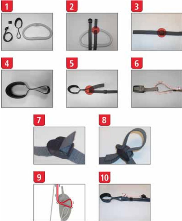
Side view: Plastic buckle + belt strap